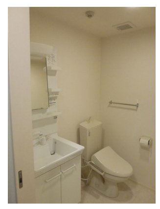
2 Toilet & Washstand