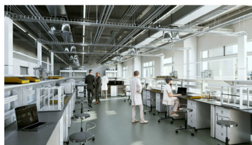
Rendering of the ITF.F facility and image of research lab